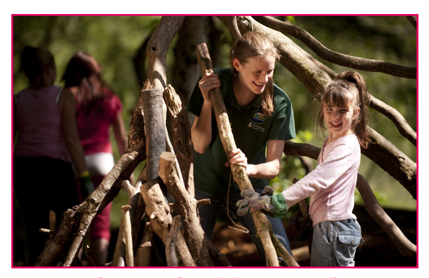
The Rose Road Association – Avon Tyrrell