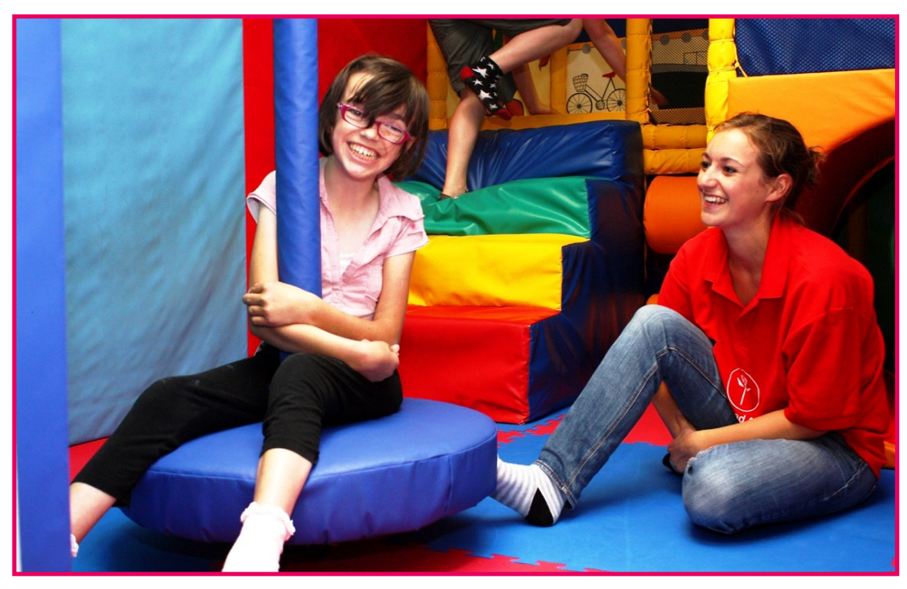
The Rose Road Association

Free 2 hour street parking or car park opposite free for 5 hours Not wheelchair accessible