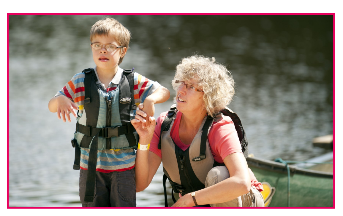
The Rose Road Association – Avon Tyrrell